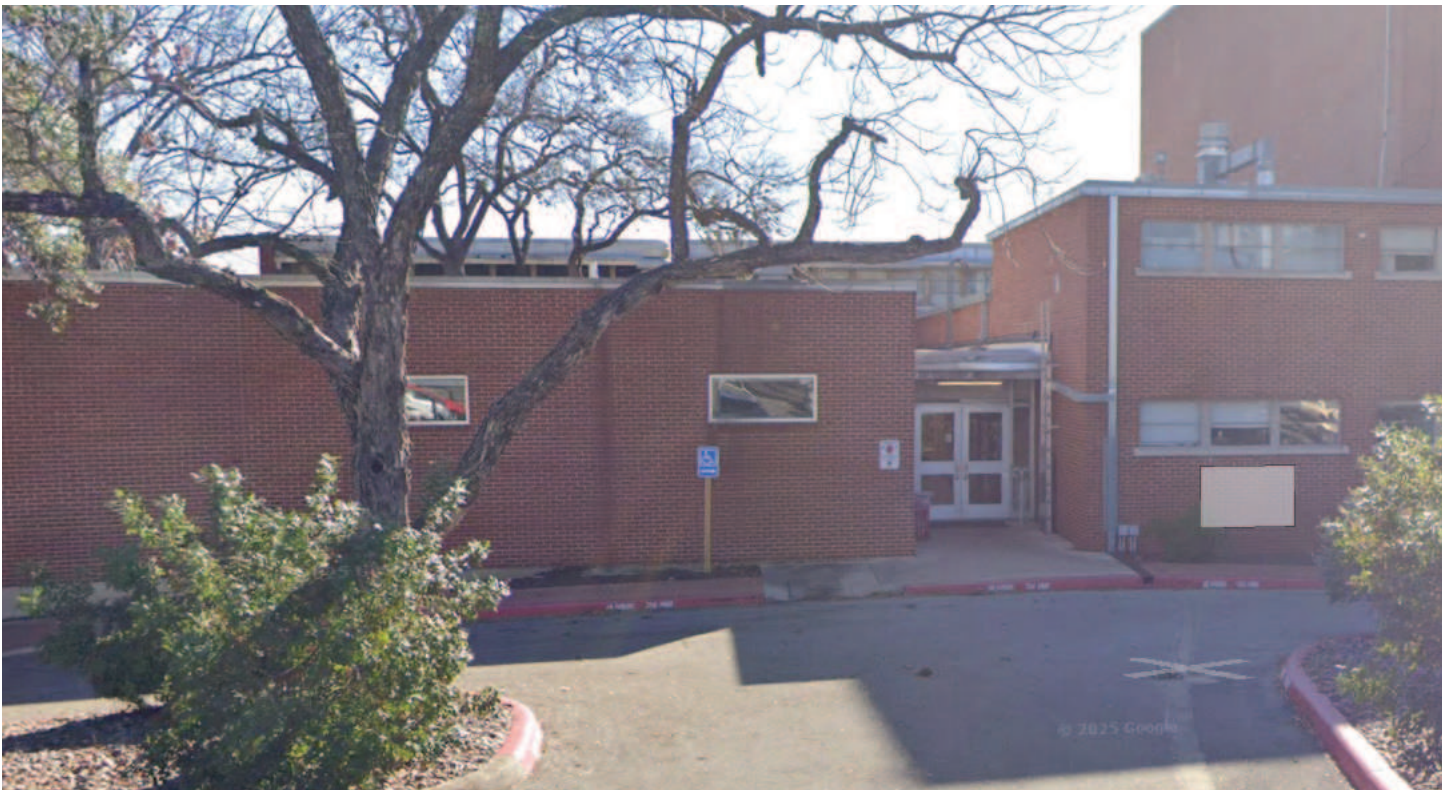
Drop off and pick up location for ALL dancers. The door is to the left of the main entrance.