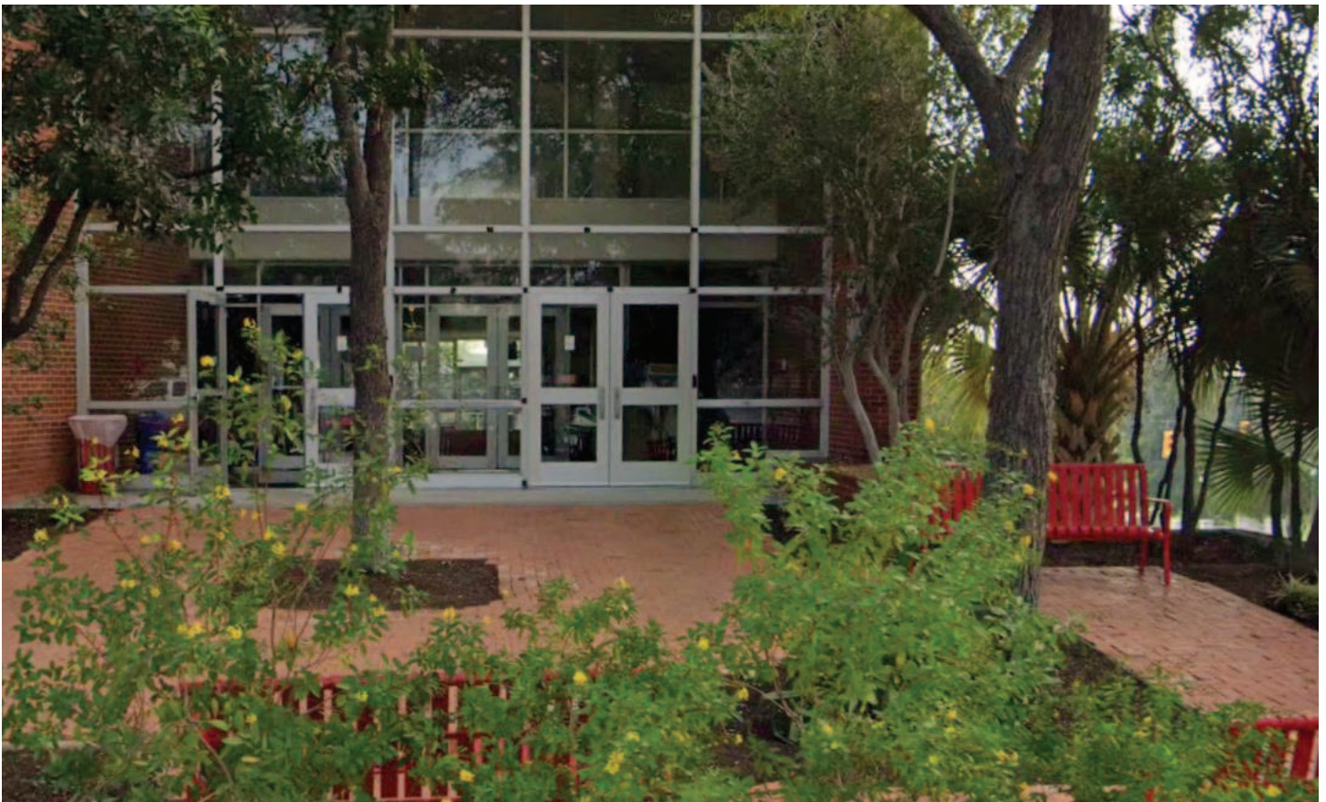
Main entrance to McAllister Auditorium lobby and theater; The courtyard is perfect for family photos.